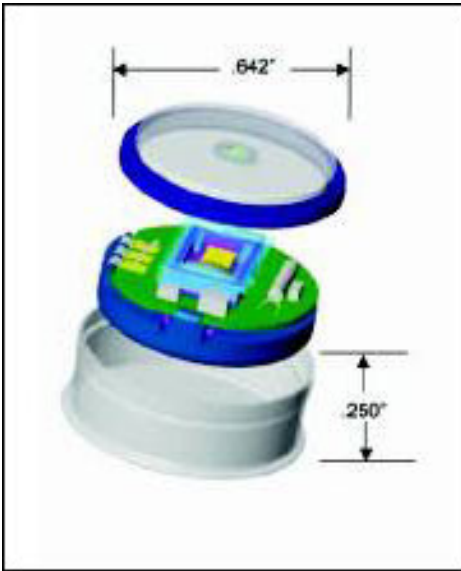
Figure 1. Illustration of the Hygrochron datalogger shows the small size of the canister and how an outer filter allows water vapor to reach the device's internal humidity sensor.

For applications where both temperature and humidity are important (for example, with foods, chemicals, powders, HVAC systems), the Hygrochron delivers unprecedented performance in an unbelievably compact, portable package.